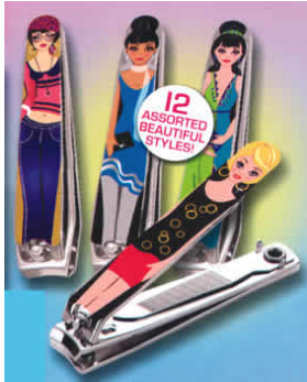
New from Uptown Girls "Snippers