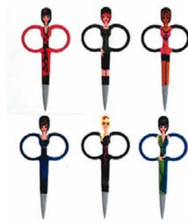
New from Uptown Girls