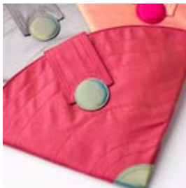
New "Silk Fan Case" by Lantern Moon great for double point needles and crochet hooks.