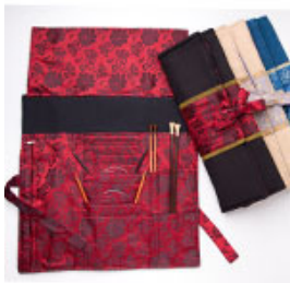
New "Silk Needle Case" Combination for both circular and straight needles from Lantern Moon.