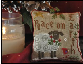
Fifth in the series of ornaments by Little House Needleworks "Little Sheep."

Ornament of the month from Little House Needleworks classes will be held the second Saturday of the month from 1p-3p. In this class if you do not know how to cross-stitch we will teach you on linen. The kit will include all supplies, chart, linen, threads and beads. Somewhere in between this monthly project we will teach you how to finish your ornaments. Cost approximately $25.00/ornament.