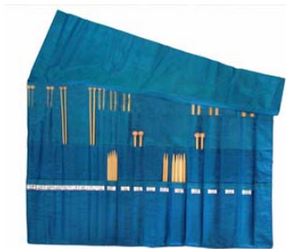
Straight needle roll from DellaQ