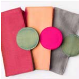
New from Lantern Moon "Mindy Case" great for repair hooks and cable needles.

We have lots of beautiful new items in for all your knitting needs and they make wonderful gifts for Mother Day.